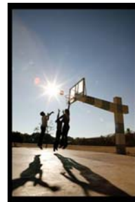
Outdoor Sports facilities Photo