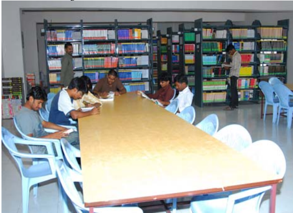
Library facilities Photo