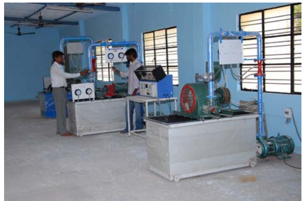
Fluid Mechanics & Hydraulic Lab