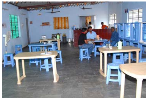
Indoor Sports facilities Photo