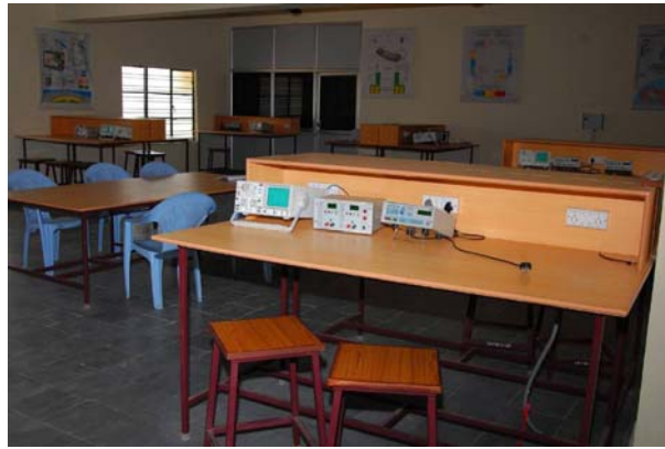
Communication Lab (AC Lab & DC Lab)