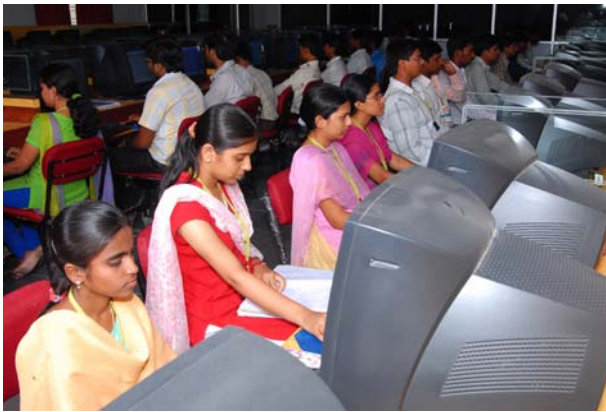
Computer Centre - I