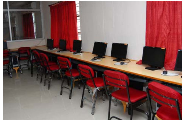
Computer Centre - II