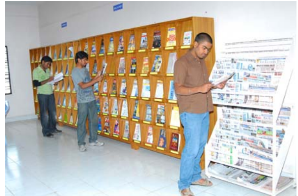
Journals Book Racks