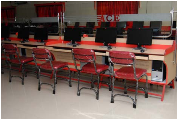
Computer Centre - III