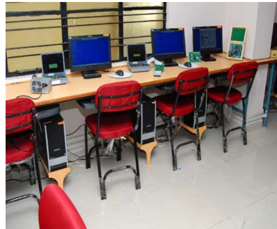
ECA Lab & IC/PDC Lab