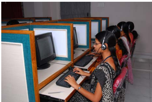
English Communication Skills Lab