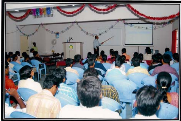
Auditorium / Seminar Halls