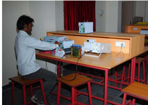
Control Systems Lab & Power Electronics Lab